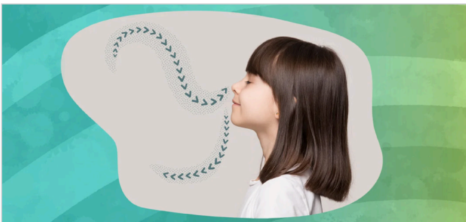
Kindergarten, Unit 2, Lesson 9 | We Can Feel Calm